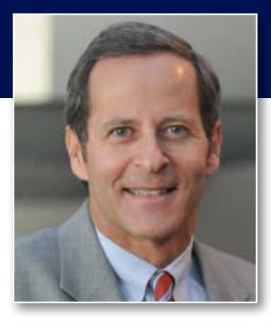
"PHC4 continues to break new ground in public accountability. They remain a key leader for implementing health reform."

The database can be especially helpful to uninsured or self-pay consumers who are usually billed the full "charge" amount. Health care providers are often willing to negotiate fees with such consumers, who can use the average Medicare payment amounts as a starting point in negotiations.