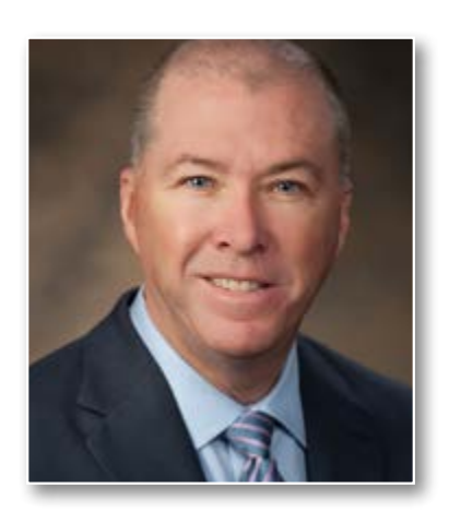
"For both purchasers and providers, the need for credible, independent health care information has never been greater. The Council's role in this new era of health care is essential to creating a health care system in the Commonwealth that provides appropriate, affordable and accessible care."