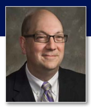
"PHC4 provides an extensive collection of reliable information to the Pennsylvania Department of Health that enriches all of our programs. Their diverse services enable our department to provide the best quality of outreach and education to state residents."