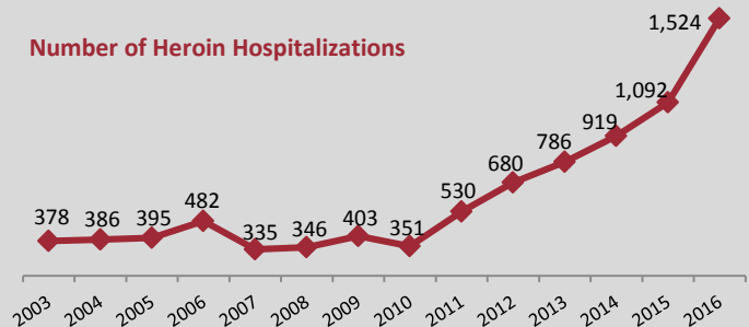
Number of Heroin Hospitalizations

786 to 1,524). The number was steady, averaging 385 a year, between 2003 and 2010.